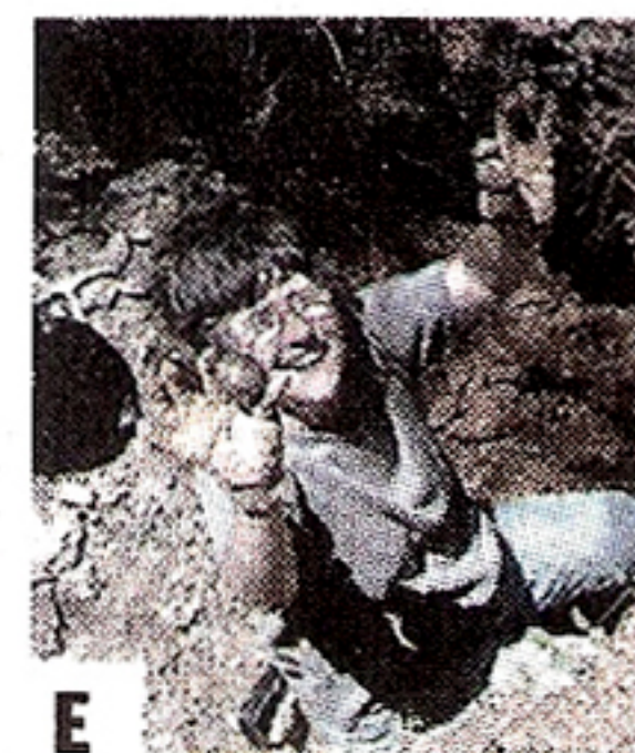
E SOUTHERN MARYLAND ROCK AND MINERAL CLUB