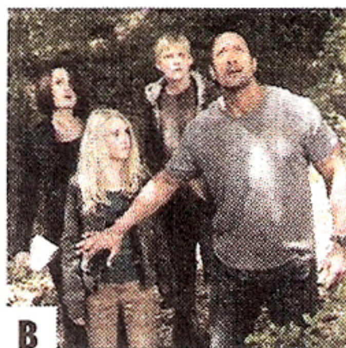
B BY RON PHILLIPS — DISNEY